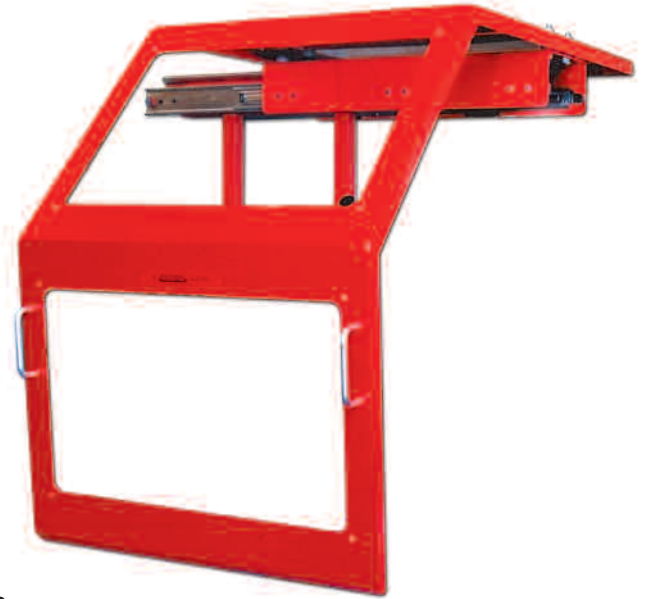
Model - SA-2